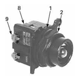
Illuminated Pushbutton Operator